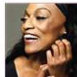
AFUWI BOB MARLEY AWARD Jessye Norman