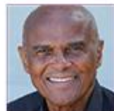
HONORARY PATRON Dr. The Hon. Harry Belafonte, OJ